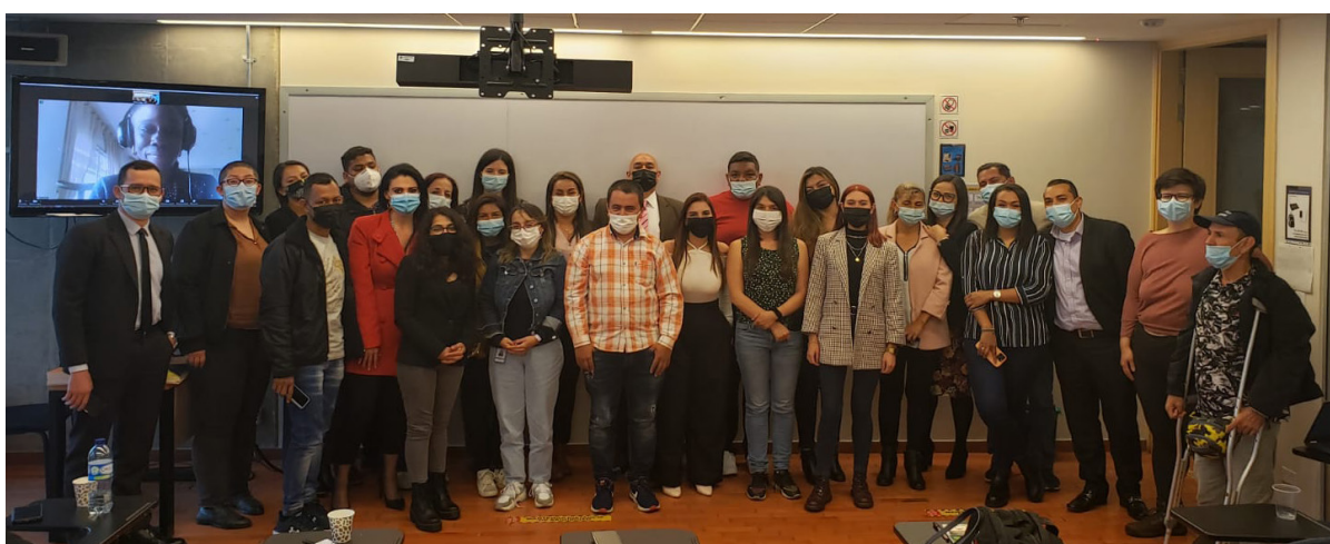
One-day workshop for the SJP’s Unit of Investigation and Accusation, delivered alongside LGBTI+ rights organisation, Colombia Diversa and representatives of the Focal Groups.

We engaged directly with the SJP to enhance awareness among and build capacity of its staff to address male and LGBTI+ people targeted by CRSV. In addition to ongoing dialogue with SJP representatives, we delivered a one-day workshop in March, together with LGBTI+ rights organisation, Colombia Diversa and representatives of the Focal Groups, to the SJP’s Unit of Investigation and Accusation (UIA). ASP’s input at the workshop on CRSV against men, boys and LGBTI+ people included lessons learned from other contexts about patterns of and harms resulting from CRSV against men and boys, and on international standards and jurisprudence relating to the investigation and prosecution of this crime.