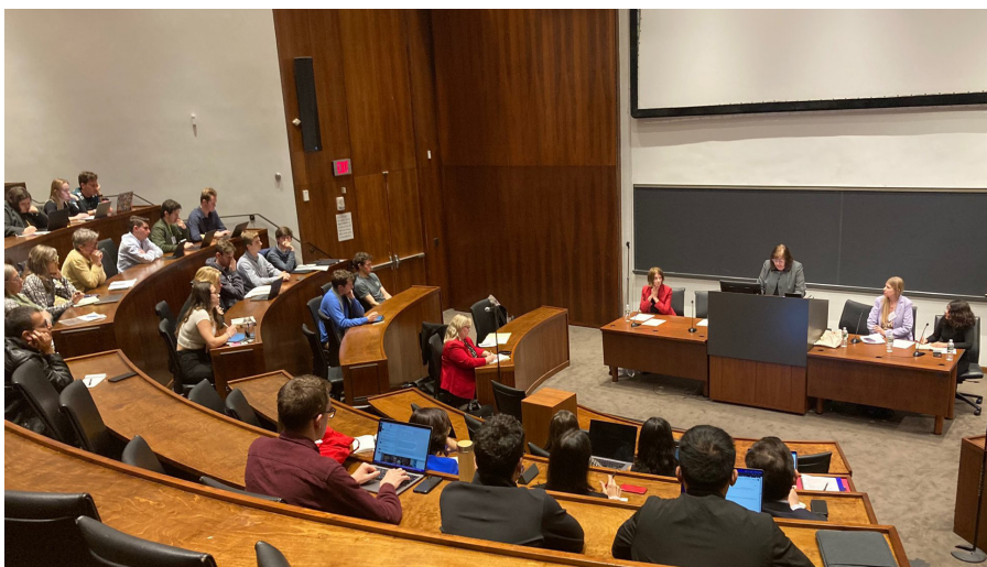
“Conflict-Related Sexual Violence Against Boys: From Recognition to Response” two-day workshop, Princeton University, 2-3 November.

involved in implementing and supporting CAAFAG reintegration programmes. 5 We found that, although CRSV against boy CAAFAG has not been documented to date, research participants believed it to be widespread. They told us that CAAFAG reintegration programmes do not adequately serve girl victims/survivors of CRSV, but that the specialised support needed to overcome CRSV is often non-existent for boys. There was consensus that far greater attention is needed to documenting the experience of boys, challenging taboos surrounding male directed sexual violence and encouraging boys to come forward for support, and that reintegration support for all victims/survivors of CRSV needs to be strengthened.